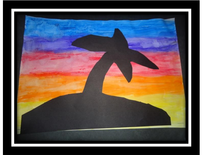
ARTIST: Hailey Myers, Mrs. Gery K

The State Flower of Hawaii is the Hibiscus flower. These large tropical flowers were the perfect object to use to help Kindergarten students learn about two and three dimensional art work. They continued to focus on only warm or cool colors as their palette. They used the watercolor crayons again since they were familiar with the material and it created a smooth transition to another blending project. The Kindergarten classes were introduced to manipulating paper and the art of quill. Students had to cut and fold their paper creating a large, colorful, three dimensional Hibiscus flower.